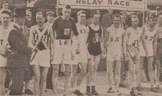
Runners lined up in St Andrew Square this forenoon for the start of the Edinburgh to Glasgow Road Relay Race.